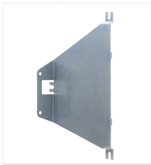
Panel Mounting Bracket KSD-8PB