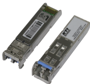
Plug in SFP Port